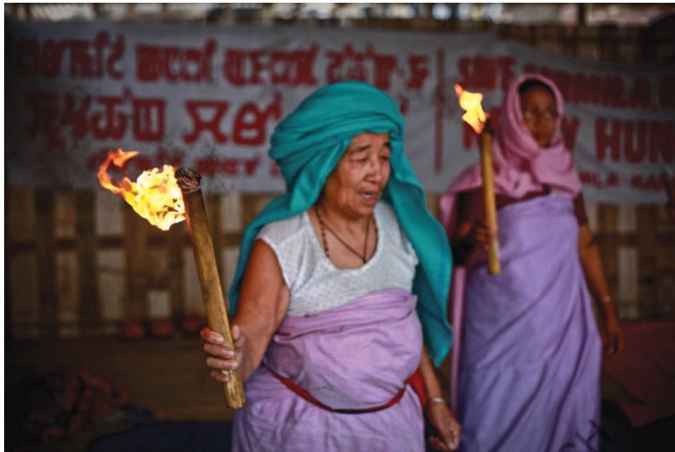
Fig. 21.8 : Meira Paibi Women in a rally

AFSPA be revoked. Gradually, the movement against this Act has grown in strength and women have expressed their struggle in different forms from boycott of elections to sitting on relay hunger strikes. One amongst them Irom Sharmila has been on hunger strike for more than 10 years and is under house arrest.