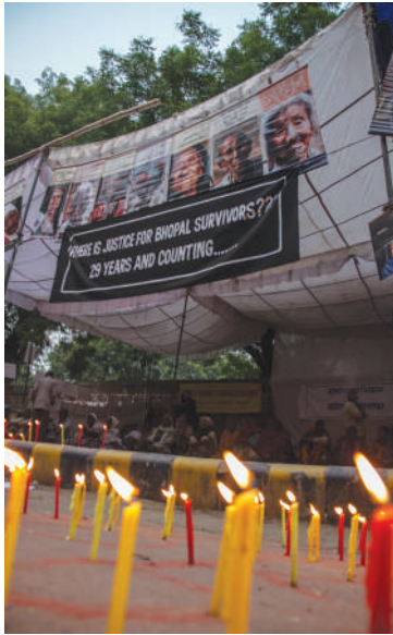
Fig. 21.4 Bhopal gas tragedy being commemorated

While they have succeeded to some measure, they are still a long way before they can claim to have achieved all the major demands. While enormous sums have been spent on setting up medical facilities in Bhopal, the victims are still suffering from its effects; compensation has been paid not as per international standards and that too not properly to all the affected people; the government failed to prosecute and punish the management of the company for its negligence which led to the accident. We do have better laws today, yet we still do not have a proper policy or adequate impartial inspecting mechanism which will eliminate the possibility of such disasters in the future. The protest against this has been even more complex since the company itself was based in USA. People today need to use international laws to fight against the problems that the factory workers and women who are affected by the pollution created by the company. Many people across the globe boycotted products made by the company. Even today social mobilisation continues when the Dow company sponsored Olympics in London, people across the globe signed petition against it. Multiple organisations from around the world pointed at the unethical alliance of Olympic body with Dow.