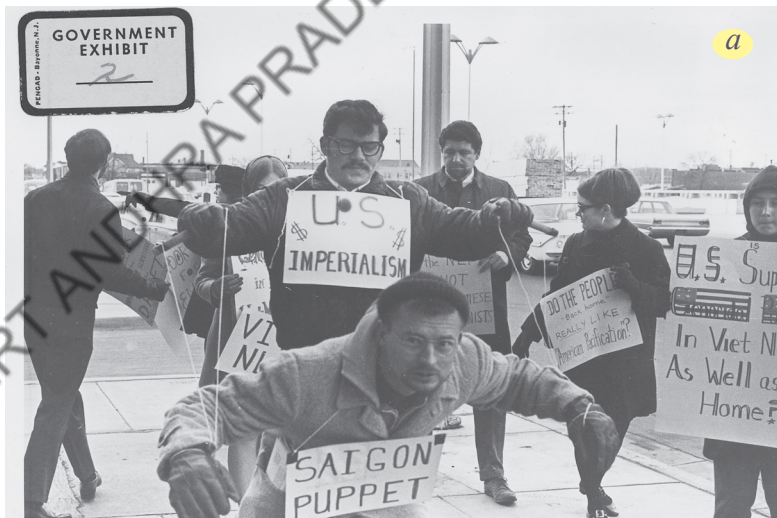
Fig 21.3: a. Vietnam War protesters; b. female demonstrator offers a flower to military police on guard at the Pentagon. Discuss the ideas in these images.

As a result of these pressures the USA and USSR, the main competitors in the arms race, began talks to cut down their nuclear arsenal - Strategic Arms Limitation Talks (SALT) which however were unsuccessful. Finally a treaty was signed in 1991 which is called Strategic Arms Reduction Treaty (START). START negotiated the largest and most complex arms control treaty in history, and its final implementation in late 2001 resulted in the removal of about 80 percent of all strategic nuclear weapons then in existence. A little after the signing of the treaty the USSR was dissolved and in its place a new Russian state was formed. With this ended the long period