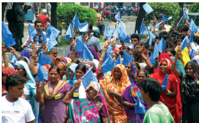
Fig. 21.5 Protest in Narmada valley against

Initially the Sardar Sarovar Project was expected to be built with money borrowed from World Bank. After intense protests, mobilisation, marches, hunger fasts and an international campaign World Bank decided to withdraw its funding.