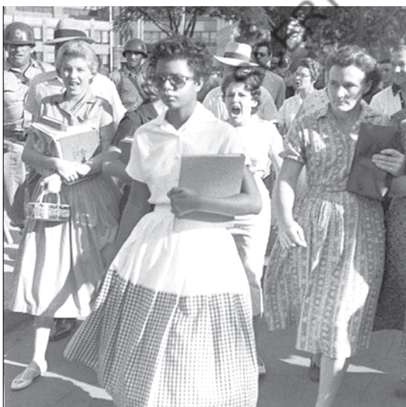
Fig 21.1 : Photograph by Will C. of Elizabeth Eckford a black girl attempting to enter Little Rock School on 4th September 1957.

The world during the first half of the 20th century was dominated by the great wars, revolutions, emergence of German Fascism, Soviet Socialism, Western liberalism, national liberation movements etc. However, with the end of the Second World War and the independence of colonies and semi-colonies like India, China, Indonesia, Nigeria and Egypt by mid 1950's a new era began in the world. This was an era of economic growth and prosperity for most of the countries, but also of growing tensions in many countries. Sections of societies which had long been denied equal rights came out asserting their rights.