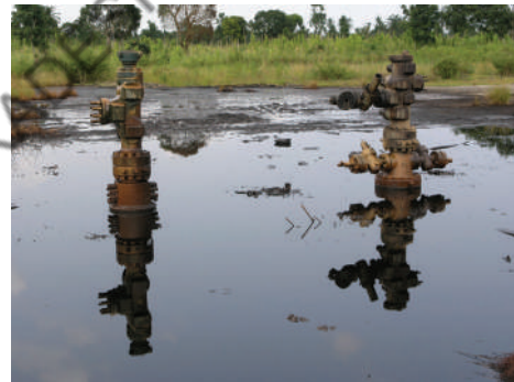
Fig 15.9 : Oil Spill

Oil was discovered in 1950s in the Niger Delta and soon various multinational companies headed by the Dutch Shell company acquired rights over oil drilling. Today it is the most important resource of Nigeria. Most of the oil wells are owned by these corporations which have extracted Nigerian oil and shared part of its profits with the military rulers. But the common people have benefitted little from this. In addition, reckless oil extraction without care for the environment by foreign oil companies has created havoc in coastal environment. Oil spillage from oil wells has a major impact on the ecosystem. Large tracts of the mangrove forests, which are especially susceptible to oil (this is mainly because it is stored in the soil and re-released annually with inundation), have been destroyed. An estimated 5–10% of Nigerian mangrove ecosystems have been wiped out either by clearing or oil. Spills destroy crops and aqua culture through contamination of the groundwater and soils. Drinking water is also frequently contaminated, and a sheen of oil is visible in many local bodies of water. If the drinking water is contaminated, even if no immediate health effects are apparent, it can cause in long term cancer. Offshore spills, which are usually much greater in scale, contaminate coastal environments and cause a decline in local fish production.