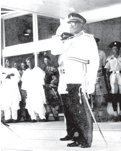
Fig 15.7 : Nnamdi Azikiwe

also supported militant attacks on the British colonial government. In 1936. The Nigerian Youth Movement (NYM) was founded by Nnamdi Azikiwe. It appealed to all Nigerians regardless of cultural background, and quickly grew to be a powerful