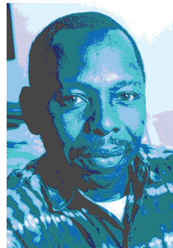
Fig 15.10 : Ken Saro Wiwa

Throughout the early 1990s popular unrest grew steadily, particularly in the Niger Delta region, where various ethnic groups began demanding compensation