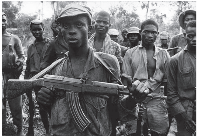
Fig 15.8 : Bifarian war

domination of the north. Attempts were made repeatedly to bring in civilian and democratic governments but these failed again and again. Corruption and suppression of human rights went hand in hand with collaboration between the military regime and multinational Oil corporations which funded the corrupt rulers.