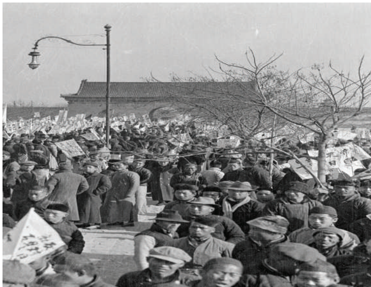
Fig 15.1 : People protesting in May fourth movement

The social and political situation continued to be unstable. On 4th May 1919, an angry demonstration was held in Beijing to protest against the decisions of the Versailles peace conference. Despite being an ally of the victorious side led by Britain, China did not get back the territories seized from it by Japan. The protest became a movement, called the “May Fourth Movement”. It galvanised a whole generation to attack old tradition and to call for saving China