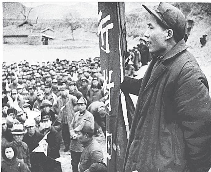
Fig 15.3 : Mao addressing people in Yanan, 1944

Guomindang. Mao Zedong's radical approach can be seen in Jiangxi, in the mountains, where they camped from 1928 to 1934, secure from Guomindang attacks. A strong peasants' council (soviet) was organised, united through confiscation and redistribution of land of landlords. Mao, unlike other leaders, stressed the need for an independent government and army. He had become aware of women's problems and supported the emergence of rural women's associations, promulgated a new marriage law that forbade arranged marriages, stopped purchase or sale of marriage contracts and simplified divorce.