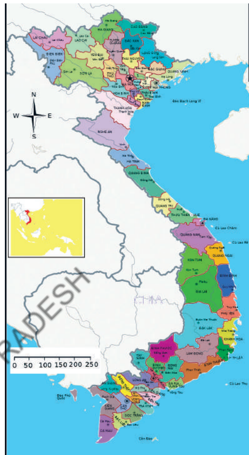
Map 2 : Vietnam

Decades of land expropriations and direct concessions to French colonists and the Vietnamese who sided with the French led to land being concentrated in the hands of large, wealthy landlords. Owning little or no land, Vietnamese peasants became entrenched in a cycle of debt, unable to break free from usury interest rates, exorbitant land rents, and suffocating taxes imposed by landlords who were also the village elites. Statistics on landlessness and landownership in the 1930s offer a devastating general picture of the harsh conditions faced by Vietnamese peasants. In Annam, in 1938 roughly 53% of families were completely landless. In Tonkin and Cochinchina, roughly 58% and 79% of families