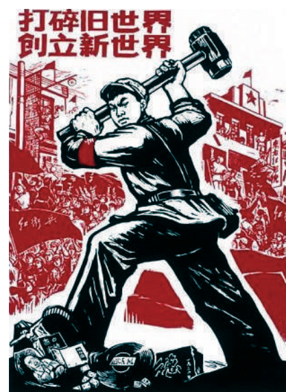
Fig 15. 2 : Poster from a later period saying “Destroy the old world, build a new world.”

The Guomindang’s social base was in urban areas. Industrial growth was slow and limited. In cities such as Shanghai, which became the centres of modern growth, by 1919 an industrial working class had appeared