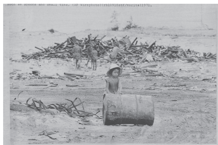
Fig 15. 6 : (a) US Army spraying chemical on trees. b) original caption of the picture: "A Use for Everything". Girl rolling drum. The metal will later be used for manufacturing small tins and spoons.