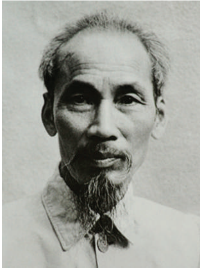
Fig 15.5 : Ho Chi Minh

Hanoi in September 1945. The Democratic Republic of Vietnam was formed and Ho Chi Minh became Chairman. When the Vietminh came to power in August 1945, they immediately issued a circular for a 25% reduction in land rents, the cancellation of all secondary rents, and the cancellation of all arrears in rent owed by tenants before August 1945. They also adopted the policy of redistributing communal land and land owned by French and Vietnamese traitors.