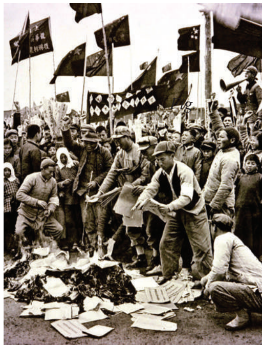
Fig 15.4 : People burning land records

After two years of relatively peaceful attempts at understanding rural situation, forming peasant associations etc, land reform proper was launched in 1950-51.