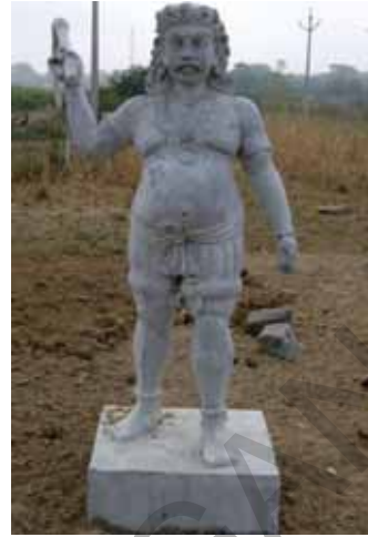
Fig 20.5 Potharaju

animals. The farmers keep a small stone painted in white in a corner of their fields. The worship of Potharaju is very simple. Prayers are offered to the deity when the crop is harvested. He has sisters who are called by various names like Peddamma.