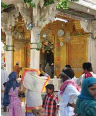
Fig 20.8 Ajmeer Dargah