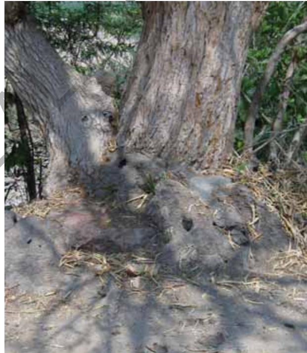
Fig 20.3 Maisamma

Yellamma: Yellamma is also called as Poleramma, ‘Maridamma’, ‘Renuka’ Mahankali, Jogamma, Somamma and by