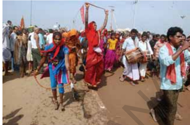
Fig 20.7 Scene from Medaram Jatara

The Medaram Jatara is organised once in two years. It is a three day fair. Sammakka and Sarakka are the formless goddesses. Caskets representing them are brought from the forests in an elaborate procession, brightly decorated and placed on the platform under a tree. At that time, devotees feel the spirits or the goddess possesses them. The people offer ‘ bangaram ’, jaggery, to the goddess.