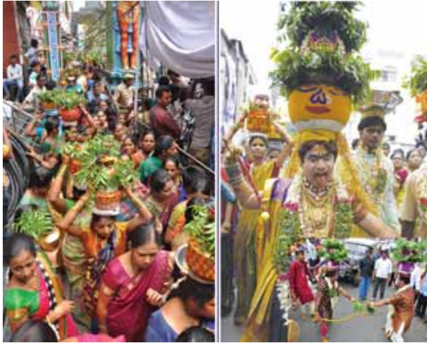
Fig 20.10 Bonalu

ornamented pots filled with flowers on their heads. The women devotees also carry brass vessels or clay pots filled with cooked rice and decorated with neem leaves. The male dancers who accompany them are known as Pothurajus, who lead the procession by lashing whips and holding neem leaves.