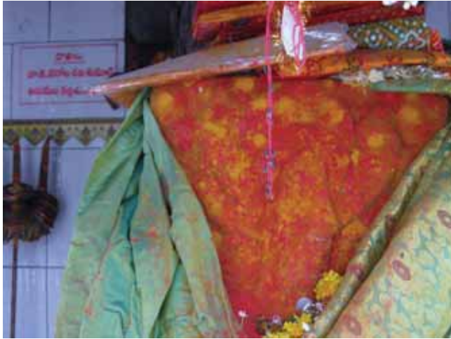
Fig 20.4 Yellamma