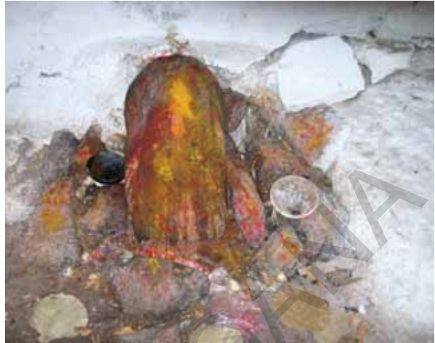
Fig 20.1 & 20.2 Here are two idols of Pochamma.

with flowers, etc. in their own language: “Mother, we have seeded the fields, now you must ensure good crop.” “My daughter is sick, you must cure her.” “Mother, keep away all infectious diseases and evils from our family.” They offer a part of the bonam and sometimes also offer a chicken or a sheep.