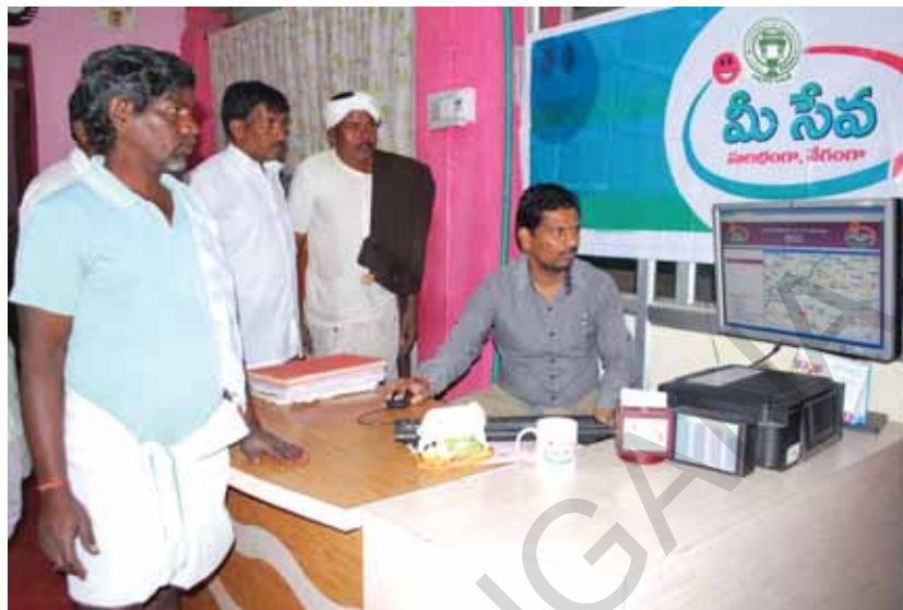
Fig 17.3 Villagers verifying the land records at 'mee seva kendra'

To understand this, first we need to understand an actual law. In the previous chapters, we have read about the significance of groundwater and how it has