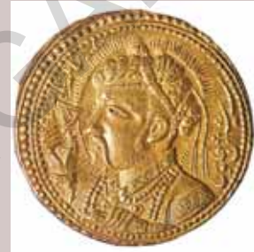
A Coin with the picture of Jahangir

A new dynasty called Mughals began with the invasion of Babar in 1526 CE. They created an empire between 1550 CE and 1707 CE and expanded it from around Delhi to all over the entire subcontinent. Their administrative arrangements, ideas of governance and architecture continued to influence rulers long after their decline. Now, every year, the Prime Minister of India addresses the nation on Independence Day from the ramparts of the Red Fort in Delhi which was once the residence of the Mughal emperors.