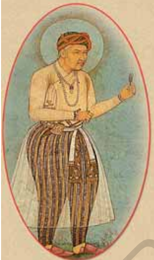
Akbar 1556-1605 CE (Left)

Sher Khan defeated Humayun, forcing him to flee to Iran. In Iran, Humayun received help from the Safavid Shah. He recaptured Delhi in 1555 CE but died in an accident the following year.