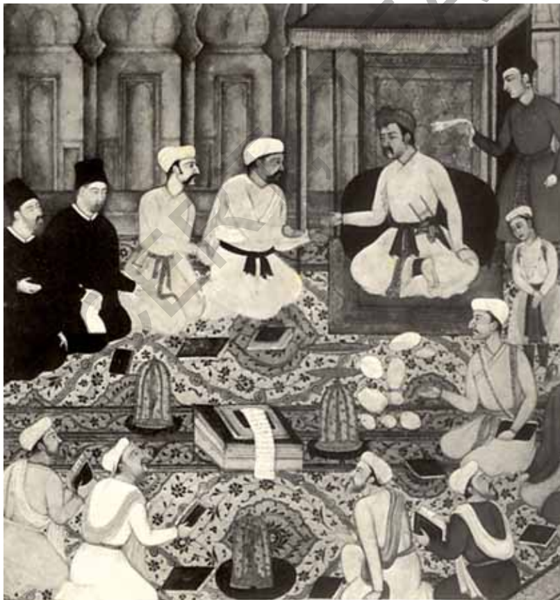
Fig 14.4 Akbar holding discussions with learned individuals of different faiths in his ibadat khana

people. Akbar wanted to bring together people of diverse faiths. This eventually gave Akbar the idea of sulh-i kul or “universal peace”. This idea of tolerance did not discriminate among people of different religions in his kingdom. Instead, it focused on a system of ethics – honesty, justice, peace – that was universally applicable. Abul Fazl helped Akbar in framing a vision of governance around this idea of sulh-i kul . The Emperor would work for the welfare of all subjects irrespective of their religion or social status. This principle of governance was followed by Jahangir and Shah Jahan as well. Aurangzeb deviated from this policy and tried to project himself as favouring only Sunni Muslims. People of other religions felt anguished by this policy of Aurangzeb.