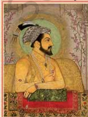
(Right) Aurangzeb 1658-1707 CE

revolts by nobles and chiefs of his empire. In 1657-1658 CE, there was a conflict over succession amongst Shah Jahan's sons. Aurangzeb was victorious and his three brothers were killed. Shah Jahan was imprisoned for the rest of his life in Agra.