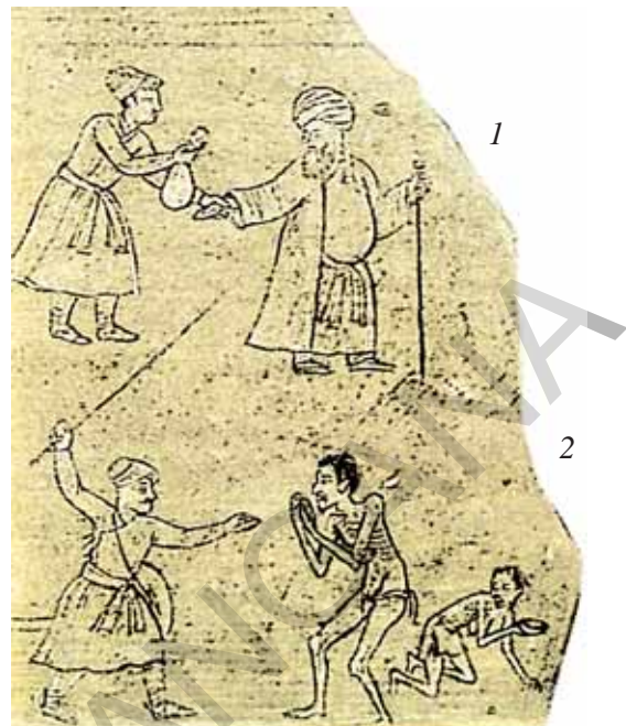
Fig 14.3 Details in a miniature from Shah Jahan's reign showing corruption during his father's administration 1. A corrupt officer receives a bribe and 2. A tax collector punishes poor peasants

In most places, peasants paid taxes through the rural elite i.e., the headman or the local chieftain. The Mughals used one term – zamindars – to describe all the intermediaries, whether they were local headmen of villages or powerful chieftains. The zamindars were not appointed by the Mughal Emperors but existed on hereditary