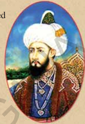
(Right) Humayun 1530-1556 CE

1526 CE – defeated Ibrahim Lodi and established control over Agra and Delhi.