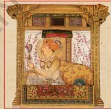
Jahangir 1605-1627 CE (above)

Akbar was 13 years old when he became the emperor. He rapidly conquered Bengal, Central India, Rajasthan and Gujarat. Thereafter, he also conquered Afghanistan, Kashmir and portions of the Deccan. Look at his empire in Map 1.