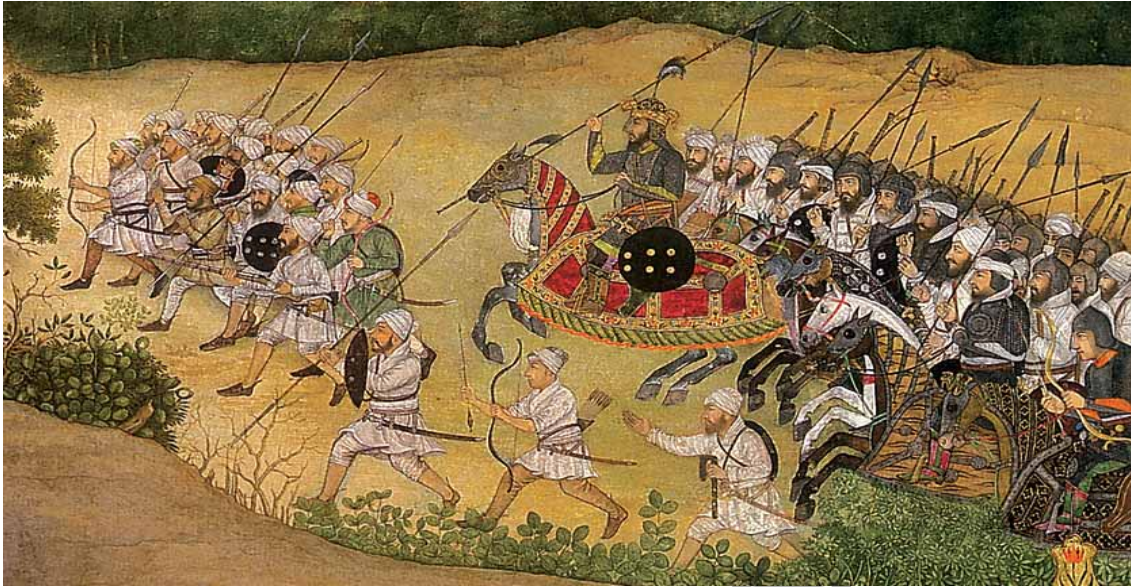
Fig 14.2 A mansabdar on march with his sawars (A miniature painting)

groups. Those who joined the Mughal service were enrolled as mansabdars (or rank holder). They worked directly under the control of the emperor, who could allocate any work for them to do – like guarding his palace, governing a province, conquering a new kingdom or suppressing a rebellion.