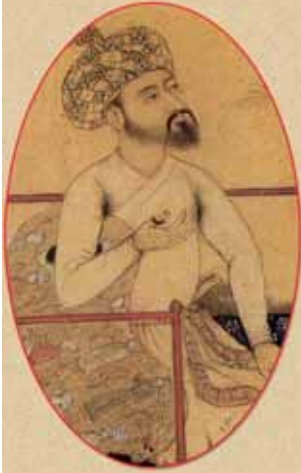
Babur 1526-1530 CE (Left)

1526 CE – defeated Ibrahim Lodi and established control over Agra and Delhi.