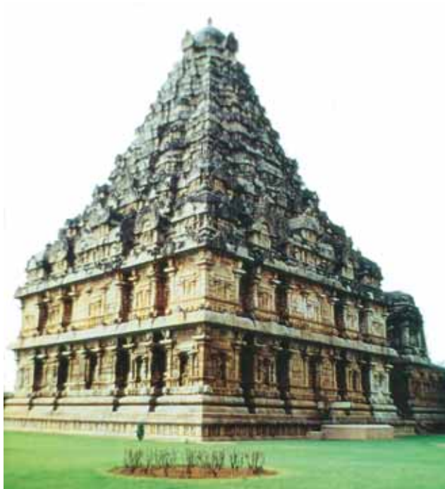
Fig 11.3 The temple at Gangaikonda-Cholapuram. Notice the way in which the roof tapers. Also, look at the elaborate stone sculptures used to decorate the outer walls

powerful Chola ruler, became the king in 985 CE and expanded his control over most of these areas. He also reorganised the administration of the empire. Rajaraja's son Rajendra I continued his policies and even conquered the Ganga valley, Sri Lanka and countries of Southeast Asia, developing a navy for these expeditions.