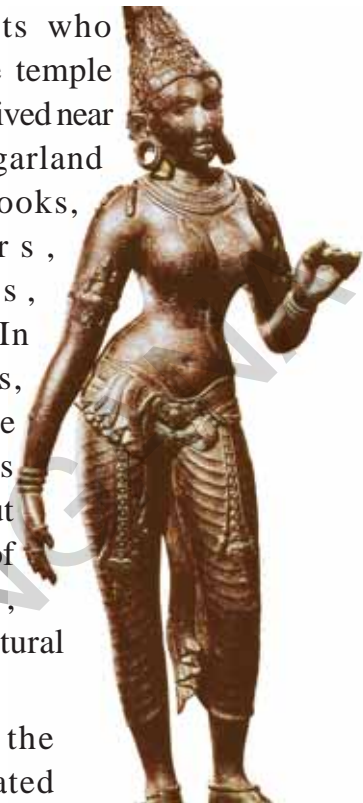
Fig 11.4 A Chola bronze sculpture. Notice how carefully it is decorated

Many of the achievements of the Cholas were made possible through new developments in agriculture. Look at Map 2 again. Notice that the river Kaveri branches off into several small streams before emptying into the Bay of Bengal. These streams overflow frequently, depositing fertile soil on their banks. Water from the streams also provides the necessary moisture for agriculture, particularly the cultivation of rice.