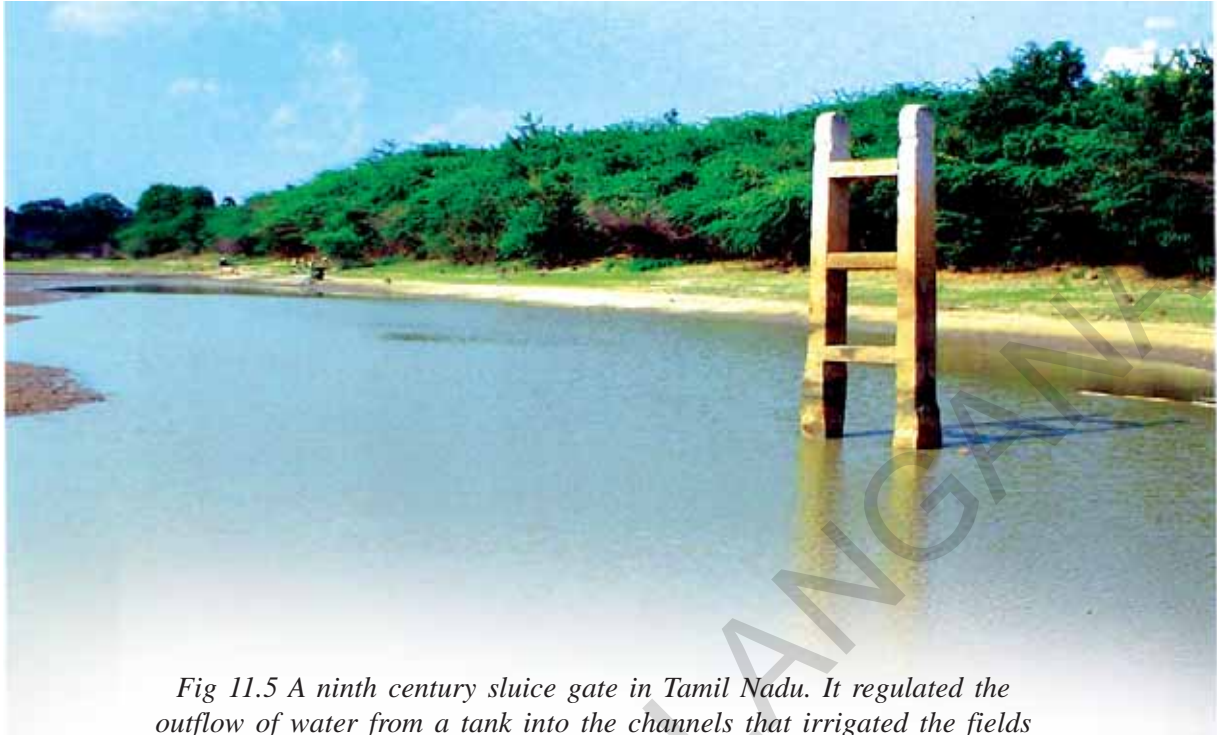
Fig 11.5 A ninth century sluice gate in Tamil Nadu. It regulated the outflow of water from a tank into the channels that irrigated the fields

Although agriculture had developed earlier in other parts of Tamil Nadu, it was only from the fifth or sixth century that this area was opened up for large-scale cultivation. Forests had to be cleared in some regions; land had to be levelled in other areas. In the delta region, embankments had to be built to prevent flooding and canals had to be constructed to carry water to the fields. In many areas, two crops were grown in a year.