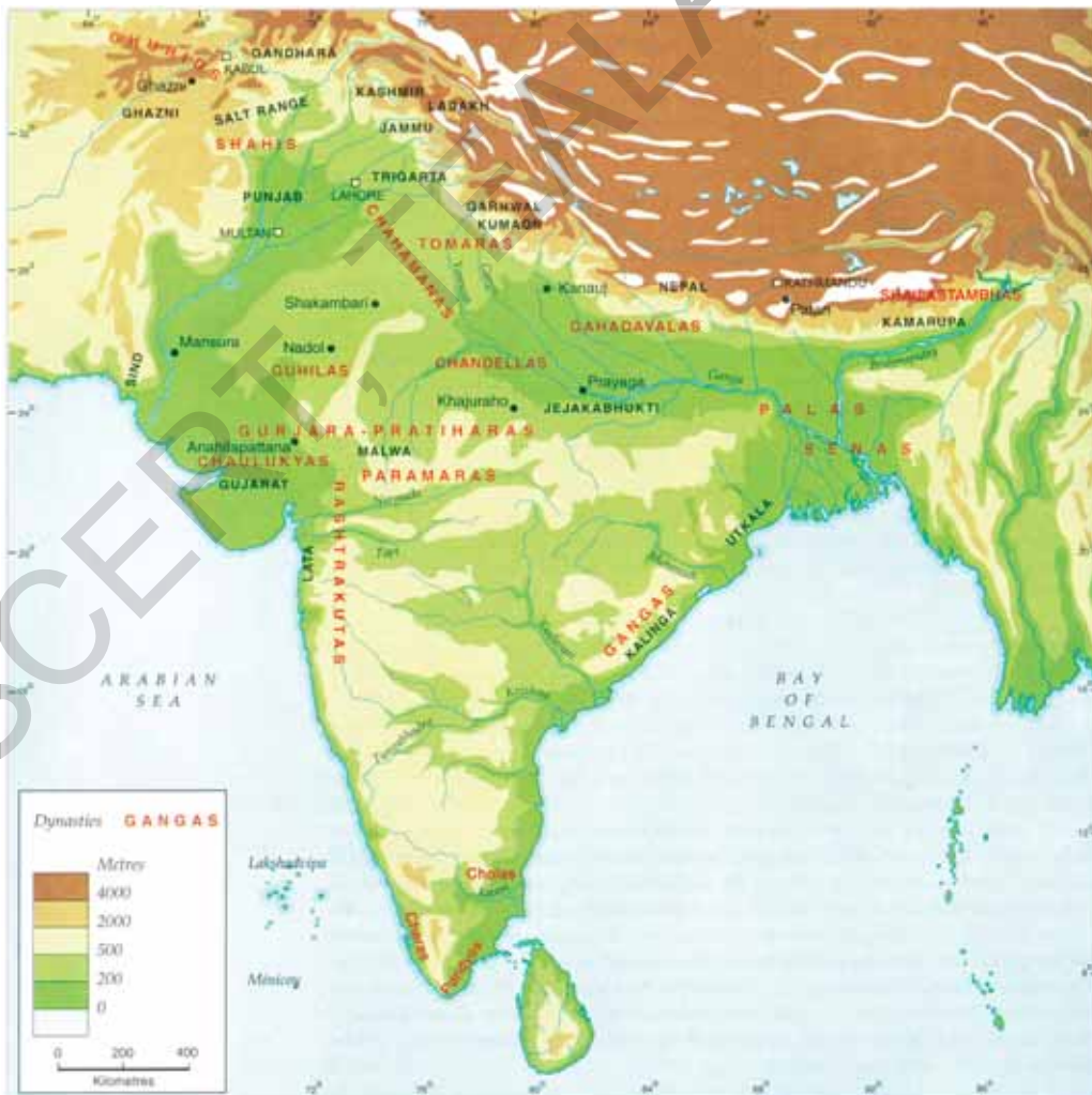
Map 1: Major Dynasties of Northern, Central and Eastern India, c.700-1100 CE