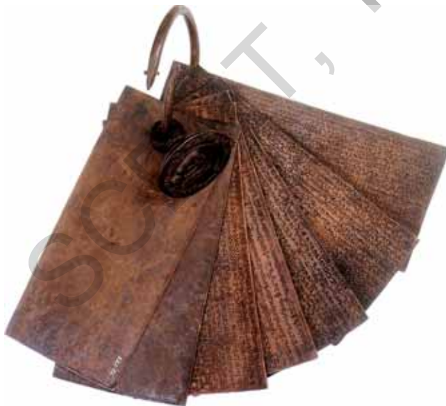
Fig 11.2 This is a set of copper plates recording a grant of land made by a ruler in the ninth century, written partly in Sanskrit and partly in Tamil. The ring holding the plates together is secured with the royal seal, to indicate that this is an authentic document

Kings often rewarded brahmins and others who served them by grants of land. These were recorded on copper plates, which were given to those who received the land.