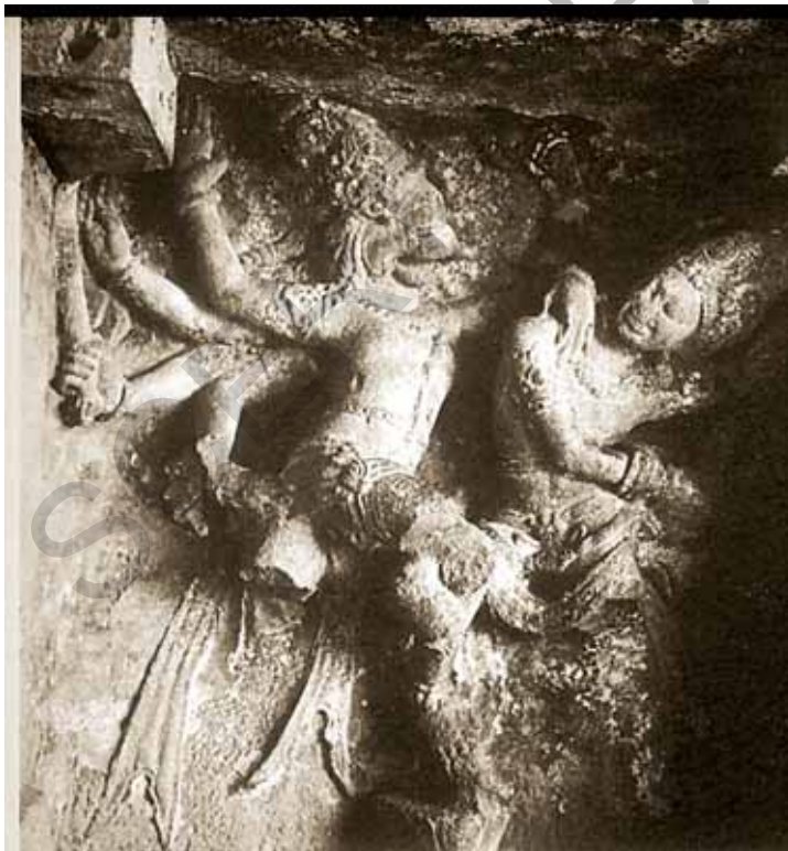
Fig 11.1 Wall relief from Cave 15, Ellora, showing Vishnu as Narasimha, the man-lion. It is a work of the Rashtrakuta period

The invocation part of an inscription is Prashasti . Prashastis contain details about the ruling family such as their predecessors and the period to which they belonged. They also contain encomiums of rulers and their achievements. But they tell us about how rulers wanted to depict themselves, for example valiant, victorious warriors. These were composed by learned brahmins, who occasionally helped in the administration.