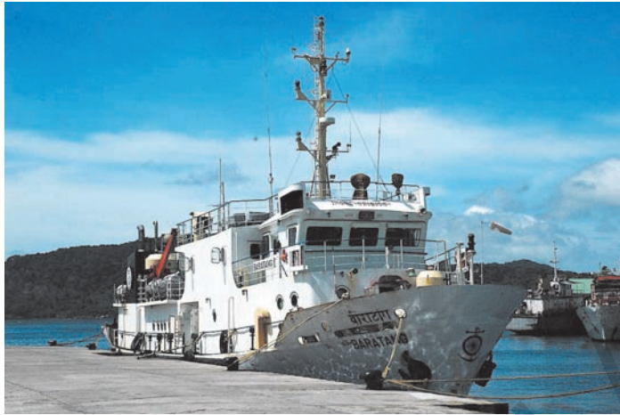
Sea route from Chennai to Port Blair

We had been longing to make a trip to Andaman; and Dad made it possible for us during the last summer holidays. Soon after the examinations, Mom made preparations for the trip. On the 25 th of April, we took the Pinakini Express from Vijayawada and reached Chennai Central by 1 p.m. After lunch, we hired a taxi for the port.